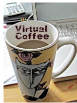
(drinking actual coffee is optional)