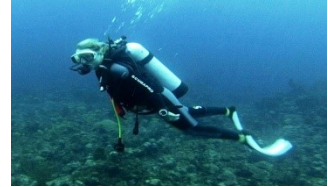
All of God’s underwater creatures thank you (especially the 4 th one)!

FYI – the dolphin shown is named Jojo and he has been a resident in the waters of Turks and Caicos for over 30 years. If you have the opportunity to share this message, please do so. One parishioner shared this with her Condo and they put it in their newsletters. The more people we make aware of this, the better off God’s creatures may be. Thank you.