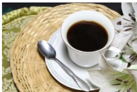
Coffee is optional

Come and join us for our virtual Coffee hour on Sunday, January 2 nd at 1:00 p.m. Even though we have our services in person now, social events won't be allowed for quite some time and we need to avoid congregating in the narthex after the service. In order to connect and share stories, tales of what we are up to, etc. we would like to continue our virtual social events and hope to have more people join us. Come and share a special Christmas memory. Join us for the hour; join us for a few minutes. All are welcome.