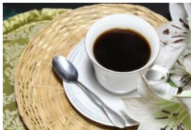
Coffee is optional

Come and join us for our virtual Coffee hour on Sunday, January 16 th at 1:00 p.m. Now that we are back to virtual services only, it's even more important to connect with others from the safety of our own homes to not feel isolated. Join us to connect and share stories, tales of what we are up to, etc. We are planning on continuing our virtual social coffee hour every other week and hope to have more people join us. Join us for the hour; join us for a few minutes. All are welcome. We would also like to have volunteer hosts. Please let the office know if you are able to help out with that.